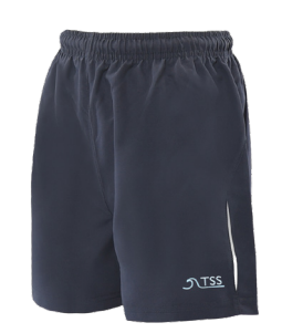
TSS SPORTS SHORTS