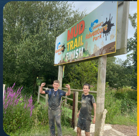
The Swanage School, 2025